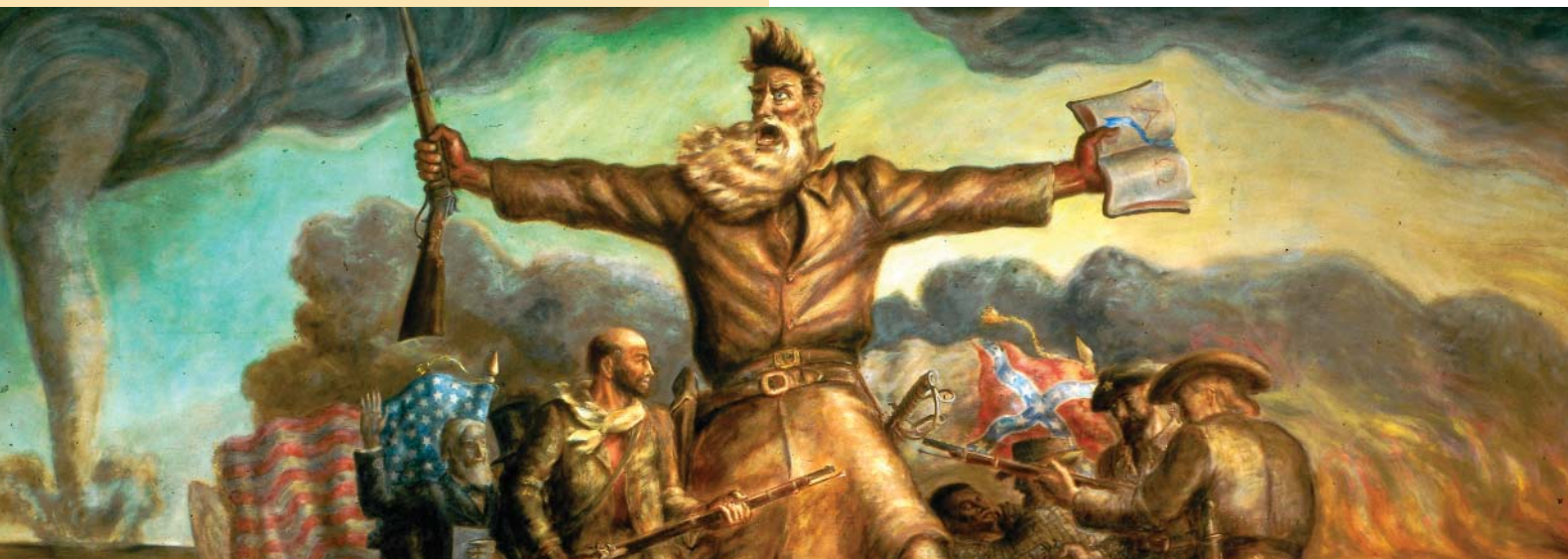
The Tragic Prelude mural in the Kansas State Capitol by Kansas artist John Steuart Curry.