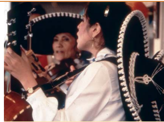
Topeka's Mariachi Estrella and aviation pioneer Clyde Cessna will be subjects of 2009 Kansans Tell Their Stories Documentary Shorts.